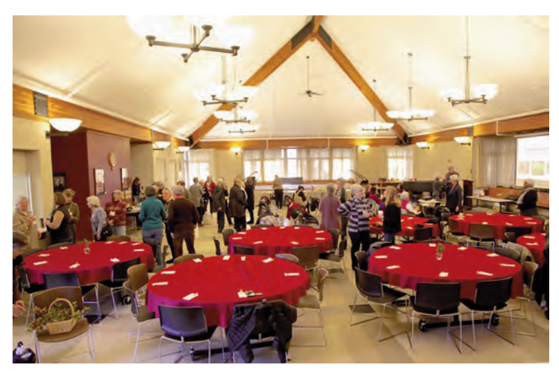
Many members now come at 10:00 in order to have time for socializing before the meeting starts.