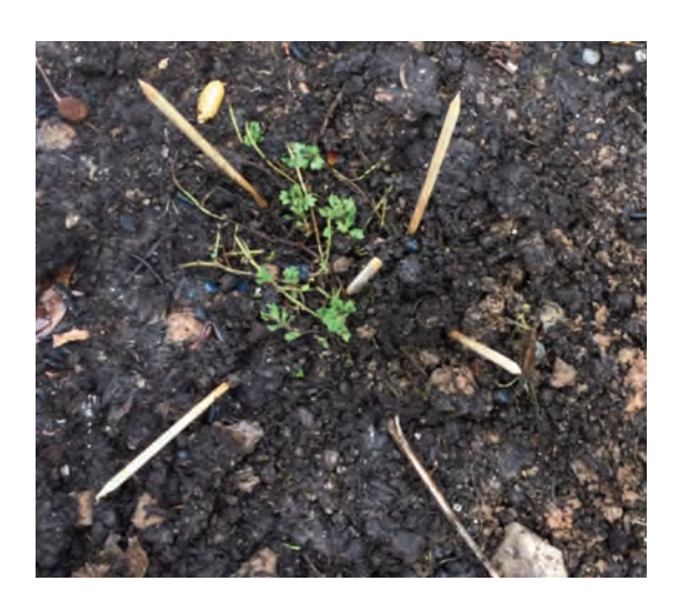
Trying to save Veronica 'Tidal Pool' from deer browse

Sometimes there will be a deer candy plant you simply can't live without—like the gorgeous creeping speedwell Veronica 'Tidal Pool' with its vivid blue white-eyed flowers. If that is the case, be prepared to defend it. Because it creeps along the ground, it is within easy reach of deer. One way to discourage herbivores is to spritz it with something smelly and, even better, encircle it with pointy wooden barbeque skewers in the hope that an uncomfortable experience will have a lasting effect.