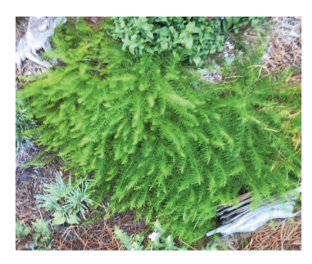
Amsonia 'Blue Ice'

Otherwise, choosing colorful plants that deer ignore is an easier way to achieve color and sanity in the garden.