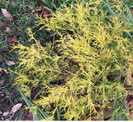
Allium 'Millenium' (top) and "Golden Mop" cypress