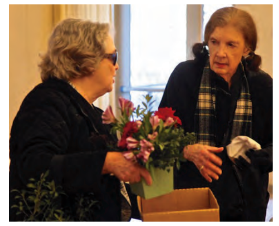
Members helped distribute the table